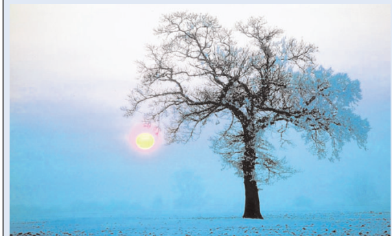
WHAT A GREY DAY! High pressure could result in a foggy winter.

OUTLOOK: An Indian summer looks possible as we head into the coming week with southerly winds bringing warm air up to us from Spain and north Africa