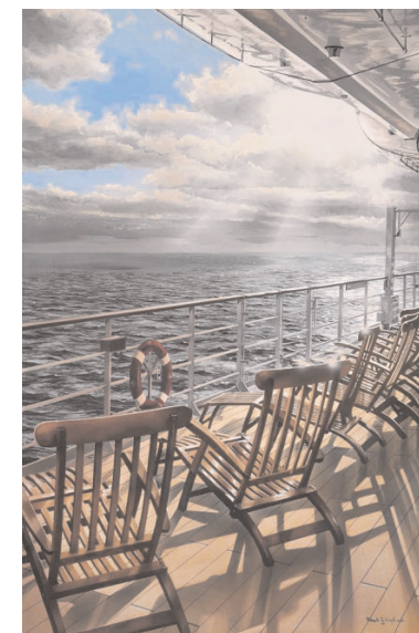
DETAILED: QM2's promenade deck.

Southampton International Boat Show announced a record attendance of 108,000 visitors and estimated sales of £15m. The number of registered overseas visitors doubled to 2,000.