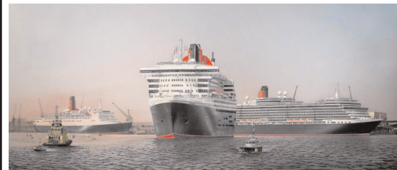
CRUISE ROYALTY: The 'three Queens' captured in Southampton Water.

The painting was commissioned by Cunard as a gift to Southampton in recognition of QE2's long and close association with her home port for almost 40 years.